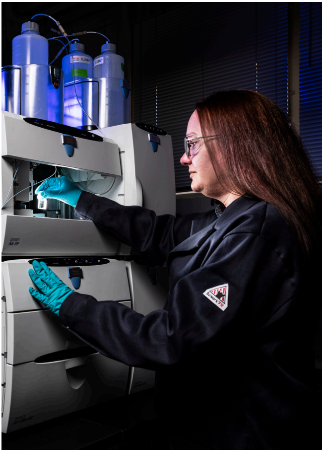
C-CDE certifies cleaning fluids used in pit production using ion chromatography and other techniques

C-CDE combines state-of-the-art research in analytical chemistry, polymers, and material science with engineering applications for solving problems of national interest. The primary customer base is stockpile manufacturing and surveillance, applied and basic energy sciences, threat reduction, industrial partners, public health, and environmental stewardship. A key aspect in C-CDE is promoting close interaction between analytical chemistry, materials and polymer science, and R&D programs. We benefit from the latest technological advancements and our R&D efforts focus on solving difficult practical problems facing the USA.