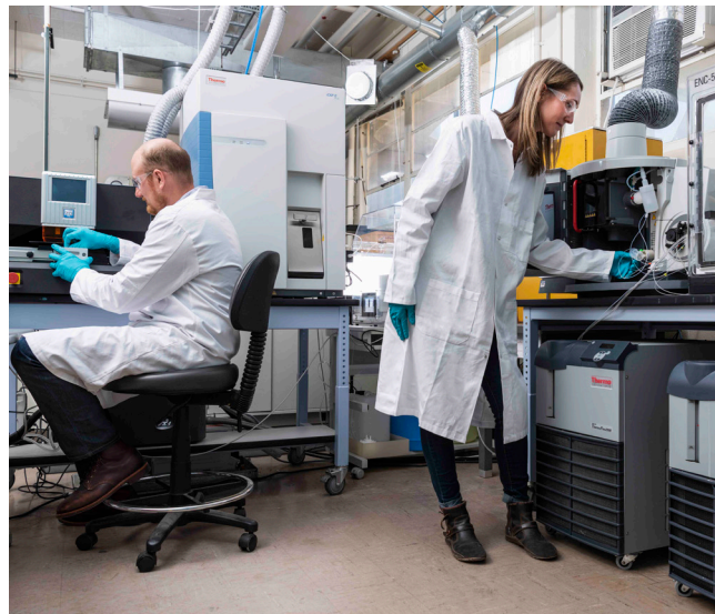
ICP-MS/OES and laser ablation ICP techniques for quantification of trace elements for samples with complex matrices

Materials characterization using nondestructive elemental analysis and spatially resolved elemental imaging with micro x-ray fluorescence. Inorganic metals analysis, isotope ratio measurements, and laser ablation of solids for ultra-low detection using ICP mass spectrometry and emission spectroscopy. Field portable LIBS, XRF, FTIR instrumentation for Global Security and Industrial applications.