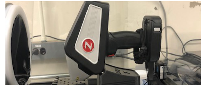
C-CDE is developing LIBS techniques for analysis of Pu to support LANL's pit production mission, U corrosion identification to support Surveillance, and actinide isotopics

Footprint maintained in Pollution Prevention studies, Biofuel Production from non-standard feedstocks, Transparent Shielding Polymers, Wide Bandgap Semiconductors, and Tritium Fuel Cycle. New technologies for 1st responders and Homeland Security. Solar energy and Thermal transport, Chem/Bio Decon.